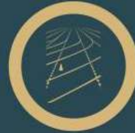
TRACKS FOR RUNNING