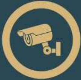
SECURITY SYSTEM CAMERAS, GUARD