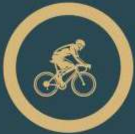
TRACKS FOR CYCLING