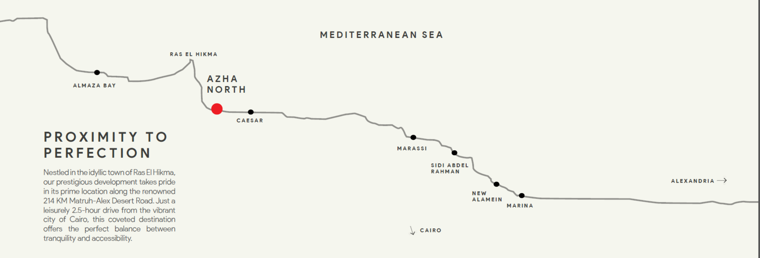
\leftarrow marsa matruh