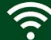
Central Wifi & Satellite