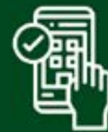
Front desk reservations