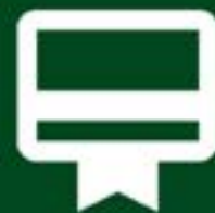
Contracting Dep. & membership medical