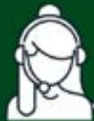
Call Center Reservations