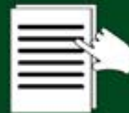
IT system for data