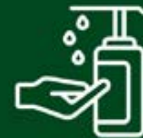
Sterilization and disinfection