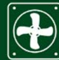
Air sterilization system